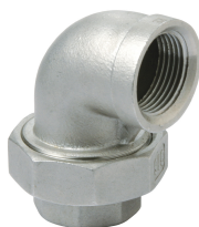
JOELHO F/F C/JUNÇÃO S/CON.