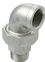
JOELHO M/F C/JUNÇÃO S/CON.